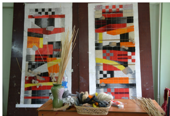
Figure 4. A modern chii panel in the process of knitting. The process from diploma work of Kumisbekova Moldir, supervisor Bazarbayeva R.E. 2016.

It is pleased to see works made by new methods in thesis works of the students of specialty of 'Artistic knitting', the department of 'Decorative applied arts' of