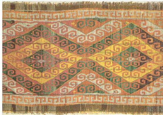
Figure 2. Shymchii. Fragment. XX century, Zhambyl oblast. State museum of art of the Republic of Kazakhstan named after A. Kasteyev.