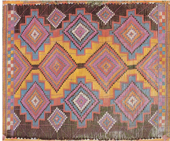
Figure 1. Shymchii. Local museum of history of Torgay oblast.

hanging it to the door. Shym chii is being used according to modern requirements.