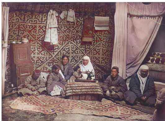
Figure 1. M. Dudin. Women and Children. Kazakhs. Kazakhstan, Semipalatinsk Region, 1899