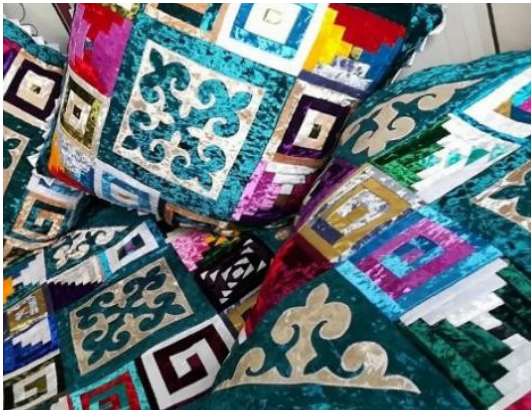
Figures 3, 4, 5. Contemporary Kazakhstani Designers and the Fashion Context of Quraq

confirming the relevance of national color in the fashion industry.