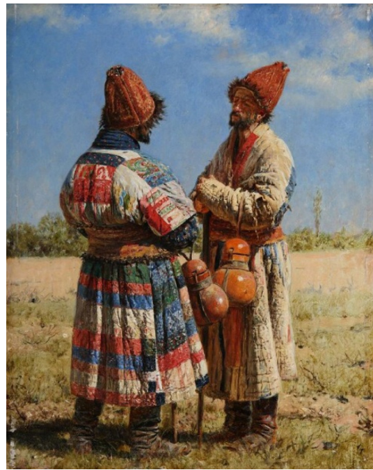
Figure 2. V. Vereshchagin (1842-1904) Two Dervishes.