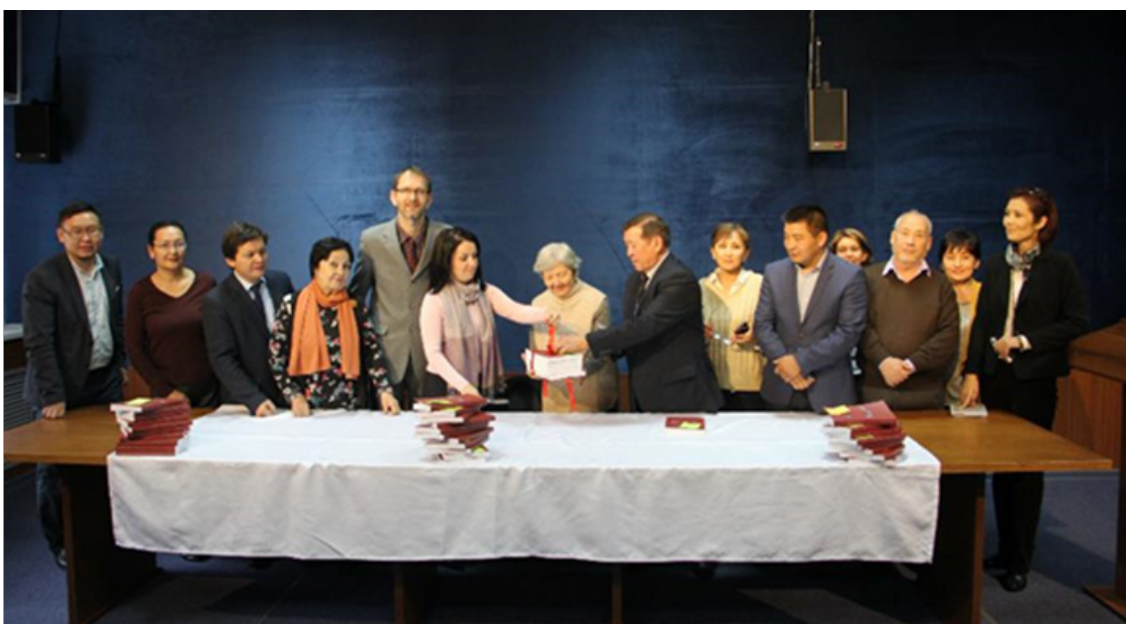
Figure 3. Photographs from the solemn presentation to the authors of T.K. Zhurgenov KazNAA, 2017.