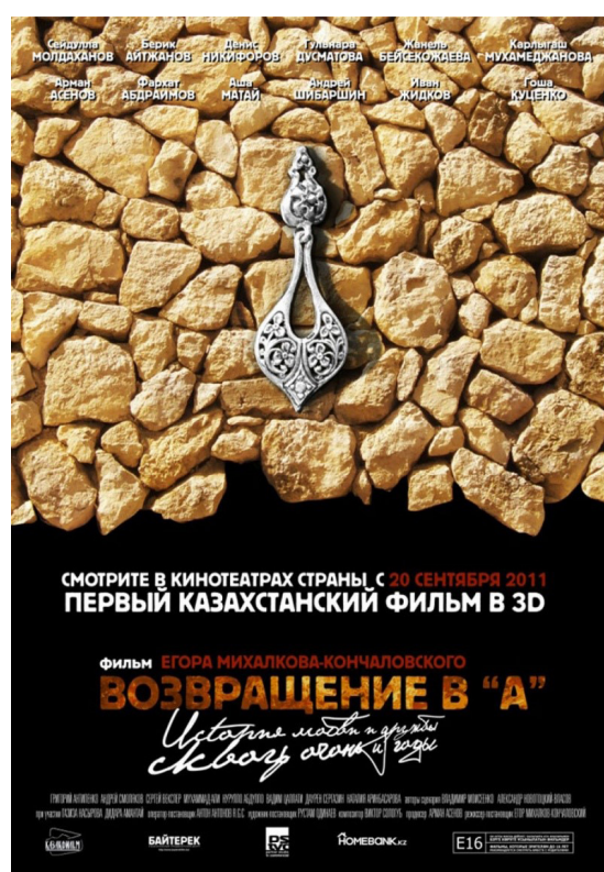
Figure 2 - “Film Returning to the 'A'”. Yegor Mikhalkov-Konchalovsky. 2011.