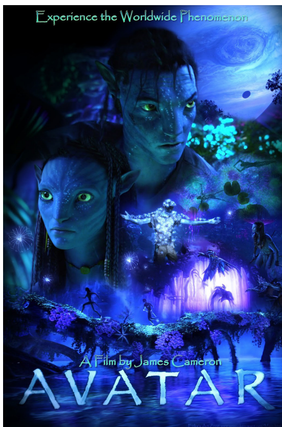
Figure 1 - Film “Avatar”. James Cameron. 2009.

Production: Kazakhfilm Film Studio named after Sh.Aymanov, together with production center Baiterek and PS TVC studio. The material was converted in 3D by 3D Azimut (see figure 2).