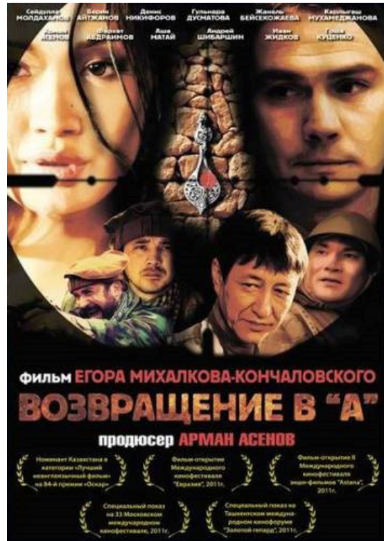
Figure 4 - “Film Returning to the ‘A’”. Yegor Mikhalkov-Konchalovsky. 2011.

for in-depth study and understanding of the leader’s role and the formation of the communicative potential both in creative and any other staff.