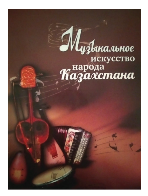
Figure 1. Scientific monograph "The Musical Art of the People of Kazakhstan": published in Almaty (Republic of Kazakhstan) by the publishing house "Evo Press", in 2014 with a total volume of 516 pages.

insufficient development of these problems served as the basis for this study ( Figure 1 ).