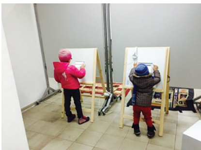
Fig. 3. Mobile Virtual Museum in the workflow of the Exhibition Hall of the Artists' Union of Kyrgyzstan Gallery in Oak Park, Bishkek, 2015

The technical difficulties of the process seem to be an obstacle for many art historians. The problem of working with new media is acute for the museums of Kazakhstan and Central Asia. To create the preconditions for a more active development of the digital archiving method, Asia Art + PF initiated the project of the Mobile Virtual Museum based on the Astral Nomads resource. The project was prepared and launched with the support of the Goethe-Institut Almaty, within the framework of the “Zeitmaschine Museum” project – (Museum as a Time Machine, 2013–2015). In April 2015, the project was introduced as a Mobile Virtual Museum in the workflow of the Exhibition Hall of the Artists' Union of Kyrgyzstan Gallery in Oak Park (see fig. 3).