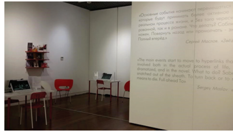
Fig. 4. Mobile Virtual Museum, the exhibition “Look into the Future: Contemporary Heritage”, National Museum of the Republic of Kazakhstan, Astana, 2016

within the framework of the exhibition “Look into the Future: Contemporary Heritage” (Astana) (see fig. 4).