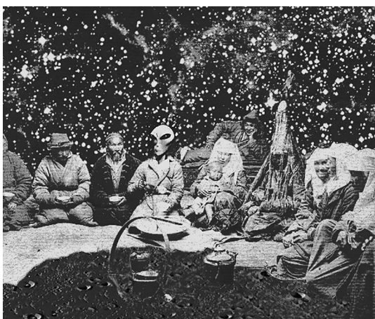
Fig. 2. Sergei Maslov, «Baikonyr 2», 1990s, multimedia project

Shortly before his death in 2002, Maslov began writing a novel called “Astral Nomads” (from where, in fact, the name of the project was taken), which was dedicated to the life of most contemporary artists in Kazakhstan. Everything was possible in the novel – to move to any point in the universe, transform space and time, follow hyperlinks, etc. (see fig. 2 ).