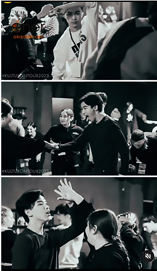
Pic. 3. The physical theater students' rehearsal

can also be considered psychophysiological processes as they combine mental and physical elements. The writings of the physical theater teachers mentioned above are complex methods of working with an actor, including psychophysiological processes, such as inner thought and intuition, as well as bodywork and psychological gestures, which help actors achieve more expressiveness on stage (Kuanyszbekova, Zhaksylykova & Nurpeys 75).