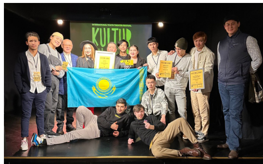
Pic. 1. The 4th year students of T. Zhurgenov KazNAA took third place in the nomination "Best plastic performance" at "Kultur On Tour 2023" festival in Germany

In general, the internationalization of methods for training physical theater students can facilitate cross-cultural exchange of experiences and enable students to broaden their horizons and deepen their understanding of various styles within physical theater. Positive results can diversify and modernize the quality of students' teaching, and professional training helps improve their skills in the field of expressiveness, movement, and facial expressions, which can increase student performance quality.