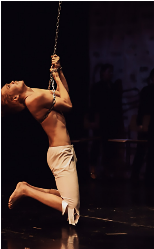
Pic. 2. The scene from “Hamlet” performed by physical theater students at “Kultur On Tour 2023” youth theater festival.

it is essential to develop physical abilities, such as flexibility, endurance, and strength (see pic 2.).