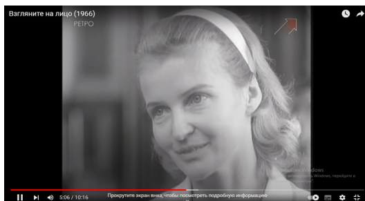
Fig. 1 A still from the video «Look at the Face,» 1966 [3].

“For many weeks, a hidden camera recorded the faces of Hermitage visitors viewing Leonardo da Vinci’s Madonna Litta , capturing people in moments of mental uplift and inner concentration. From the succession of different human characters, ages and temperaments captured by her a story about the meeting of man with the beautiful, about the